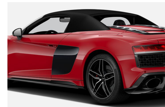
Alloy wheels, 5-V spoke Evo in titanium grey matte